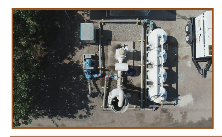
Check out a video showing the pilot test process here: <u>www.southforkkings.org/ASR</u>

A State Board permit was obtained. Extensive monitoring of water levels and water quality occurred throughout the test. The test successfully characterized a range of operational issues that need to be considered to implement ASR in more wells across a larger area.